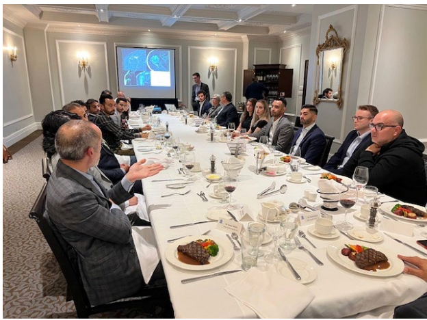
Fellows Rounds – September 2022