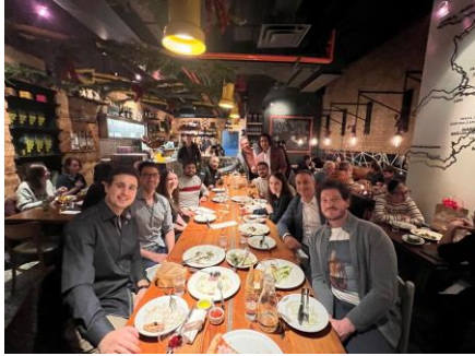
UTOSM Holiday Party – December 2022